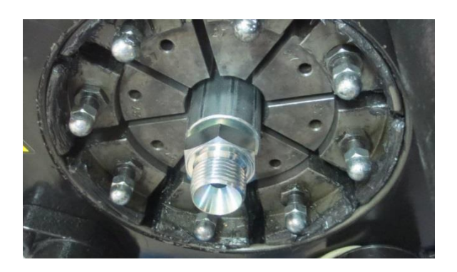
To avoid presence of ridges on the ferrule after swage, position protruding ridges central to crimping dies.