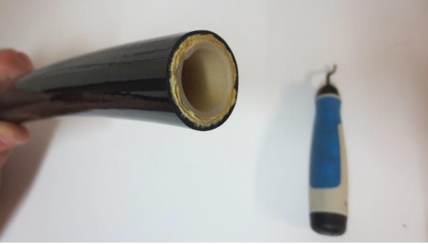
Use a proper tool to remove burrs and/or residual from the cut surface.