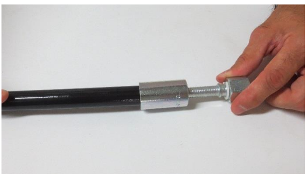
Marking the insertion depth of the ferrule and then put insert into the hose.