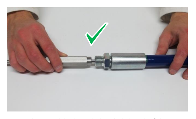
1. Go side must slide through the whole length of the insert